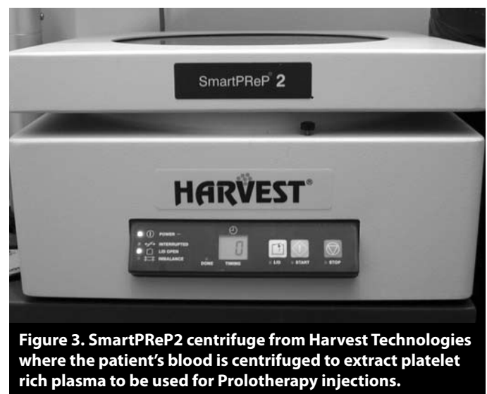
Figure 3. SmartPReP2 centrifuge from Harvest Technologies where the patient's blood is centrifuged to extract platelet rich plasma to be used for Prolotherapy injections.