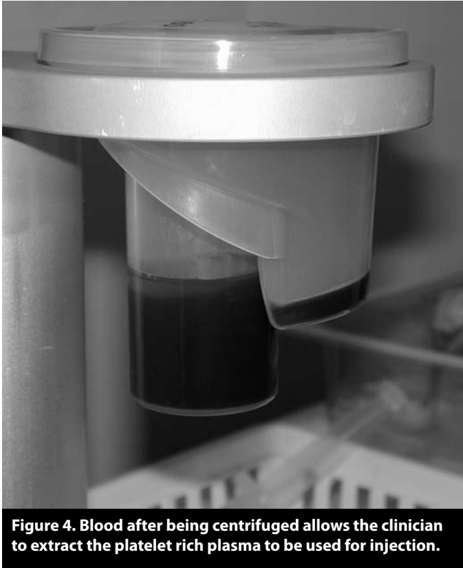
Figure 4. Blood after being centrifuged allows the clinician to extract the platelet rich plasma to be used for injection.

baseline as an acceptable standard. 56 Haynesworth et al. 57 demonstrated that the proliferation of adult mesenchymal stem cells and their differentiation were directly related to the platelet concentration, particularly showing a dose-response curve, which indicated that an adequate cellular response to platelet concentrations first began when a four to five fold increase over baseline platelet numbers was achieved.